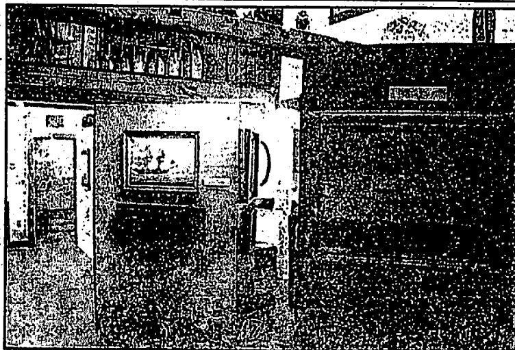
"Duxbury on the High Seas" maritime artifacts and Duxbury ship portraits.

The changes are part of an effort to expand the museum and to open up more space for rotating exhibits. "We've